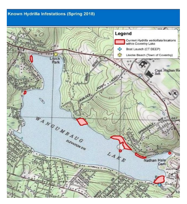
Known locations of hydrilla at Coventry Lake (Wangumbaug Lake). Boaters should avoid these areas noted with red to avoid fragmenting and spreading hydrilla.

QUADDICK LAKE (launch access). The park gates will be closed for the season to vehicular access on October 29.